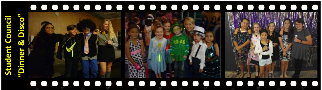
Student Council "Dinner & Disco"